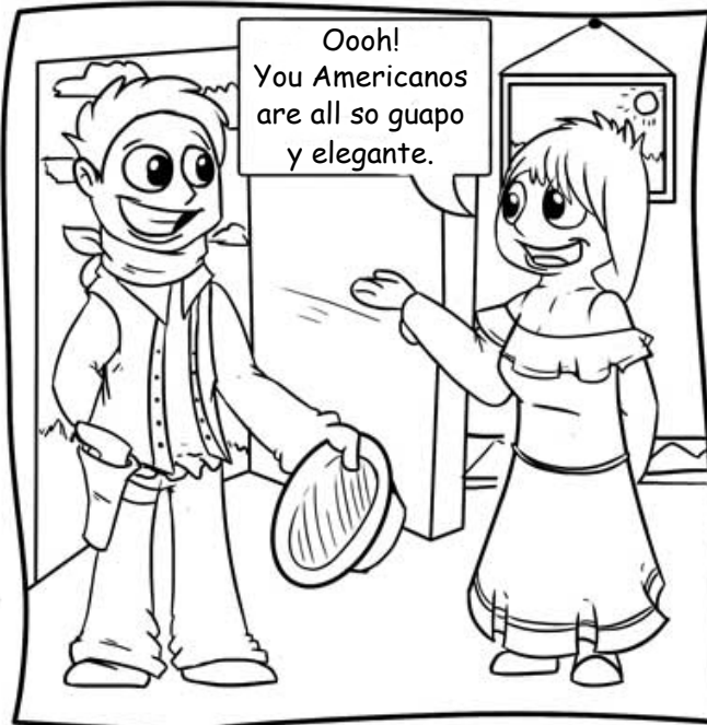
The Bachelorette 57

I had no dowry. They called my husband a slob Because he was poor and he needed a job . He worked hard. We lived modestly and never went into debt With the result that our family enjoyed comfort and respect.