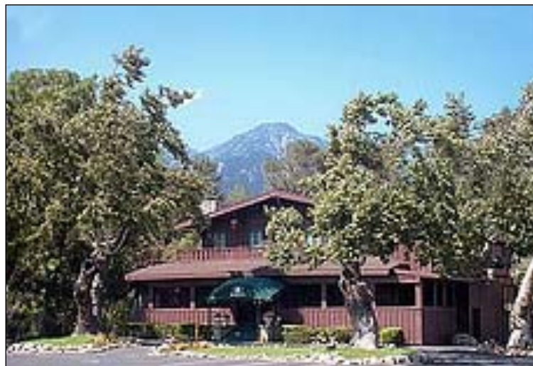
Sycamore Inn, Rancho Cucamonga, 2010