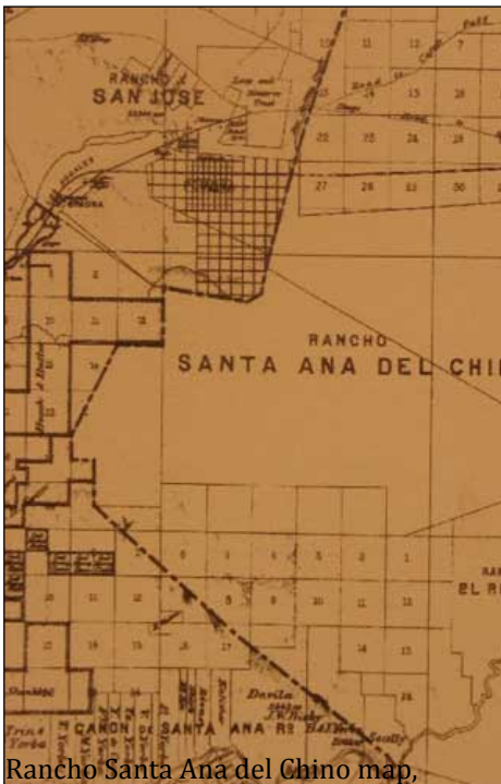
Rancho Santa Ana del Chino map, circa 1860